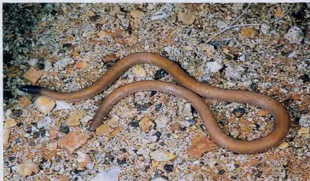
Figure 3. Paratype of A. picturata in life.